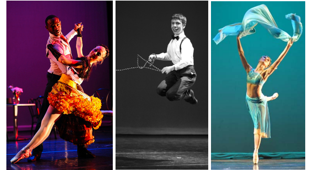
Visions d'Amour: 10 Ballets in Paris • Hult Center

Ballet Fantastique, a 501(c)3 nonprofit organization, keeps classical ballet vibrantly alive through unique, world-class, Northwest-centered training, educational, and performance experiences for artists and audiences of all backgrounds and means.